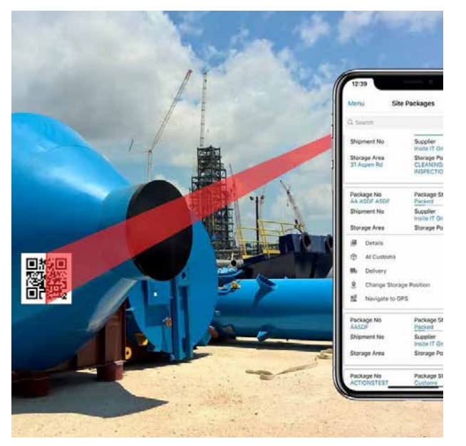
Scanning material via Insite LMS

Nogueira Itamar: If you provide a well-designed, tested, extremely lean and fast process, there is no need to convince external subcontractors and customers. When we introduced the site management software Insite LMS and trained our external users, they immediately started using it without any restrictions. Their feedback, of course, provided us with a valuable external perspective that led to adjustments that brought huge benefits to all our stakeholders. To sum up, I can say that Insite LMS is well-suited for our needs and our users appreciate the all-in-one app for accomplishing their respective tasks.